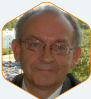
Vladimir L Voeikov Russia