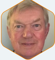
David Tredinnick United Kingdom